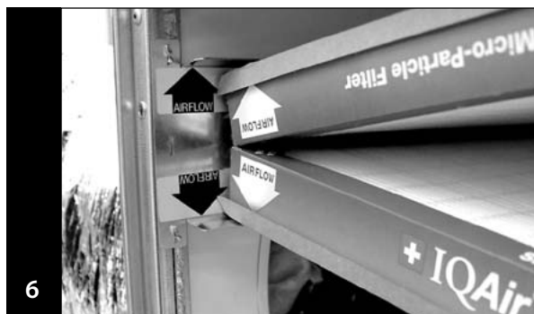
6 Ensure that you align the filters with the airflow arrows matching the airflow arrows on the cabinet.