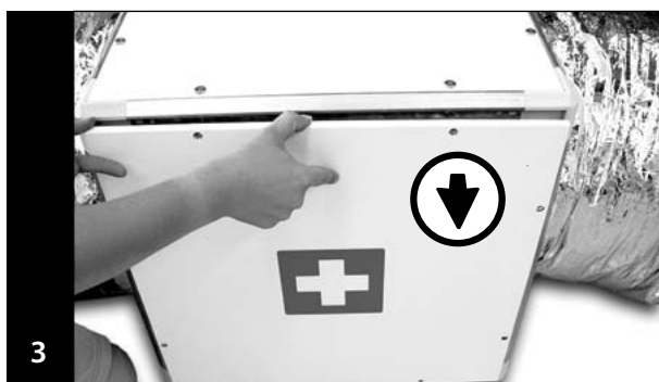
3 Remove access panel.