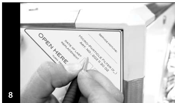
8 Fill out the filter replacement label with date of current filter replacement. Affix sticker to outer panel. (With average use, filters last up to 3 years based on 50% HVAC usage.)