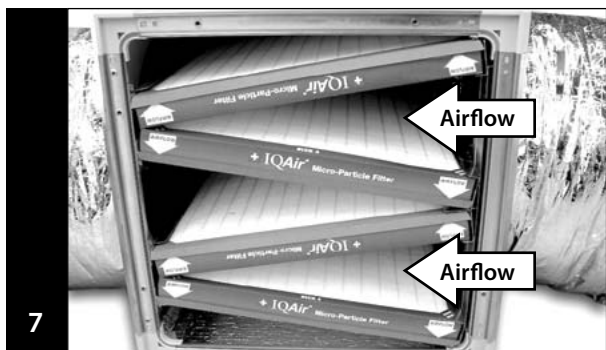
7 Double check that all filters have been inserted correctly and replace access panel with screws.