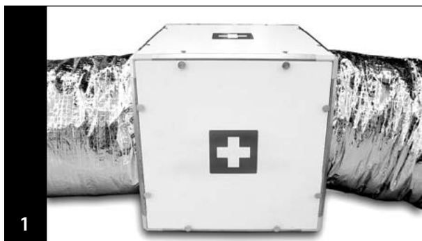
1 First, turn off HVAC System. Access to replace filters is gained from the side panel with finger screws attached to it.

IQAir's PerfectAir Program helps you maintain the cleanest indoor air by helping you stay on top of replacing your Perfect 16 air filters. Sign up today at www.IQAir.com/PerfectAir